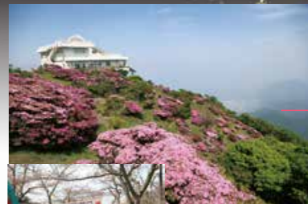
Rhododendron blossoms around Tsurumi Sanjo Station

The foot of Mt. Tsurumi is well known for its beautiful cherry blossoms, especially the elegant Yoshino cherry, and the top of the mountain is covered with Rhododendron blossoms during this season.