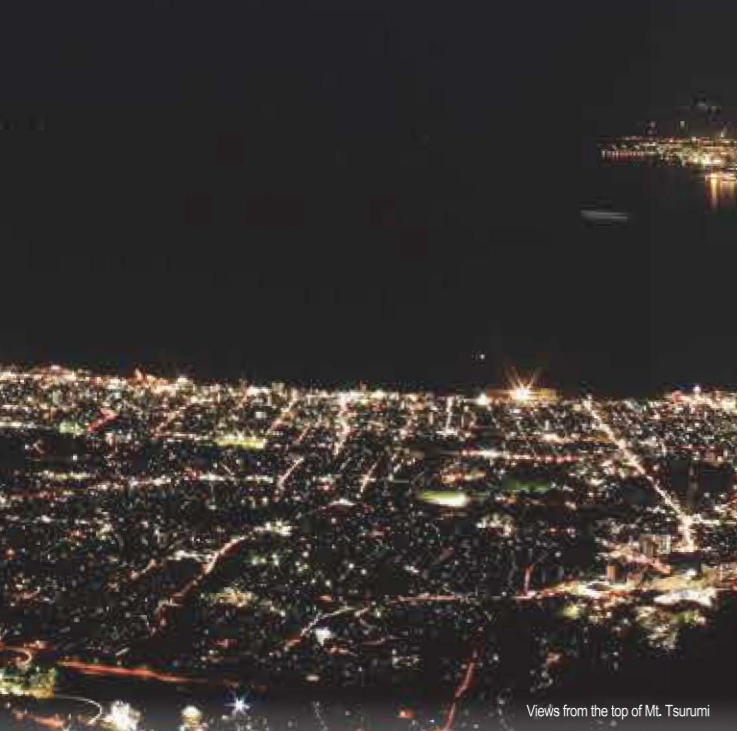
Views from the top of Mt. Tsurumi