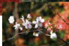
Single-flowered Parvifolia blooming in autumn

The leaves of the Acer rufrinerve and Siebold maple change gradually to red. Starting from the top of the mountain, the change spreads slowly to the foot over about a month's time. At the foot of the mountain, Parvifolia start blooming. You can enjoy the rare scenery of autumn leaves and cherry blossoms during this season.