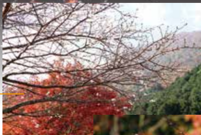
Autumn leaves at the foot of Mt. Tsurumi

The leaves of the Acer rufrinerve and Siebold maple change gradually to red. Starting from the top of the mountain, the change spreads slowly to the foot over about a month's time. At the foot of the mountain, Parvifolia start blooming. You can enjoy the rare scenery of autumn leaves and cherry blossoms during this season.