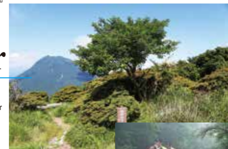
Mt. Yufuin seen from Mt. Tsurumi

The top of Mt. Tsurumi is about 10 degrees C cooler than the bottom, making summer a refreshing time to visit. Enjoy the fantastic night views from the top of Mt. Tsurumi.