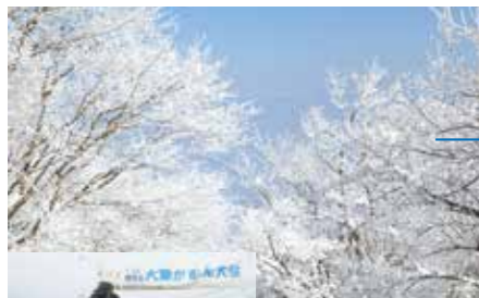
Hoarfrost at the top of Mt. Tsurumi