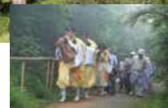
Mt. Tsurumi Summit Festival

The top of Mt. Tsurumi is about 10 degrees C cooler than the bottom, making summer a refreshing time to visit. Enjoy the fantastic night views from the top of Mt. Tsurumi.